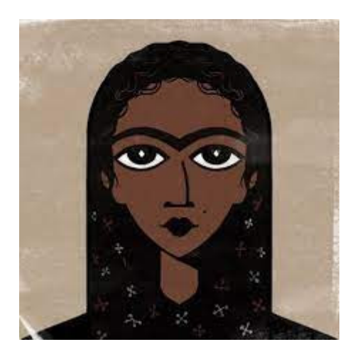
BLACK HISTORY MONTH

Happy Black History Month! This month, we celebrated the contributions of Black Americans that have transformed our country for better. The story of Black History Month begins in 1915, half a century after the Thirteenth Amendment abolished slavery in the United States. The theme of Black History Month 2022, "Black Health and Wellness,"